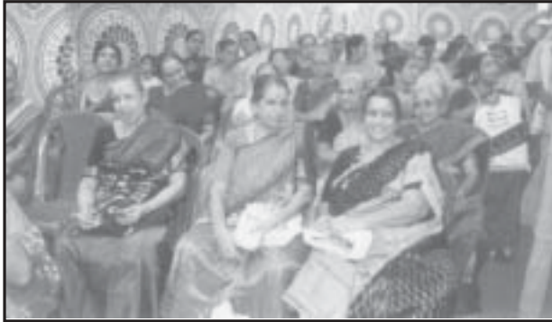
A view of the large gathering

Diyadeyam means 'the belief that I am not the giver, but God has given me the urge to give.'